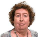
Helen Mary Jones MS Plaid Cymru